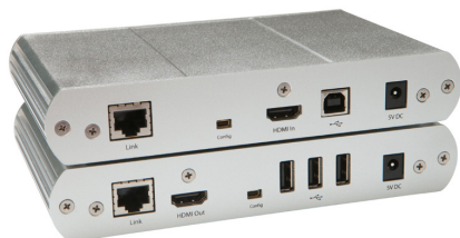
Rear view of LEX (top) and REX (bottom)