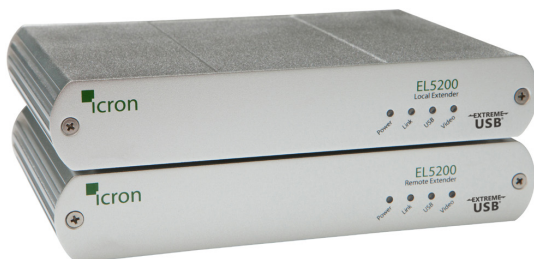
LEX (Local Extender)

The EL5200 extends both HDMI and USB 2.0 up to 100m using a single Cat 5e* cable.