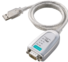
Terminal Block Adaptor for UPort® 1130/1130I/1150/1150I